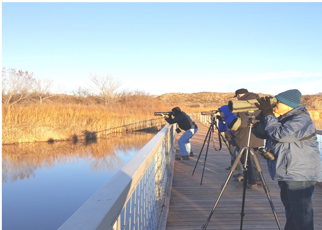
The class spots a female Hooded Merganser at the Bosque del Apache.