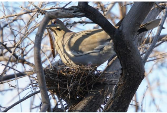
Nesting White Winged Dove, Tellbrook Park 1/16/2019. It looks like they will be with us at least another year!

You can be a citizen scientist, just for the fun of it.