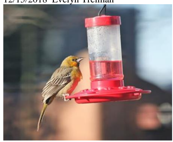
Bullock's Oriole (seen at a private residence by owner on 12/17/18 at 4 Hills neighborhood)

I would like to thank all the birders who gave of their time to bird in the 2018 Las Cruces CBC. I especially want to thank our team leaders. Without their planning and organizing of their teams, our CBC would not even be possible.