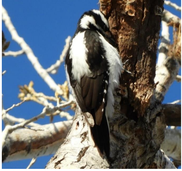
Hairy Woodpecker. CJ Goin.