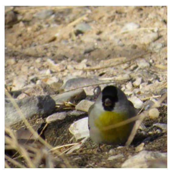
Lawrence's Goldfinch (male) – Tellbrook Park) 12/15/2018 Evelyn Treiman

owner on 12/17/18 at 4 Hills neighborhood) are below.