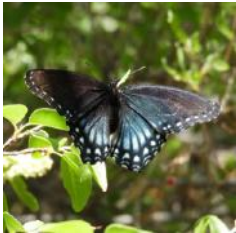
Red-spotted Purple Swallowtail Butterfly

Editor's note: In the last edition (Fall 2022) of Roadrunner Ramblings there was a mistaken reference made to one of the butterflies pictured. Below is a repeat copy of the photo with the correct species identification.