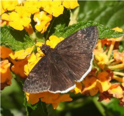
Funereal Duskywing #1