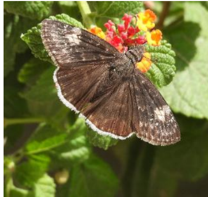
Funereal Duskywing #2