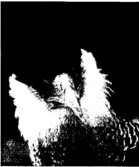
Crested Caracaras inhabit open shrublands; their US distribution is limited to southern Texas, Arizona, and Florida.