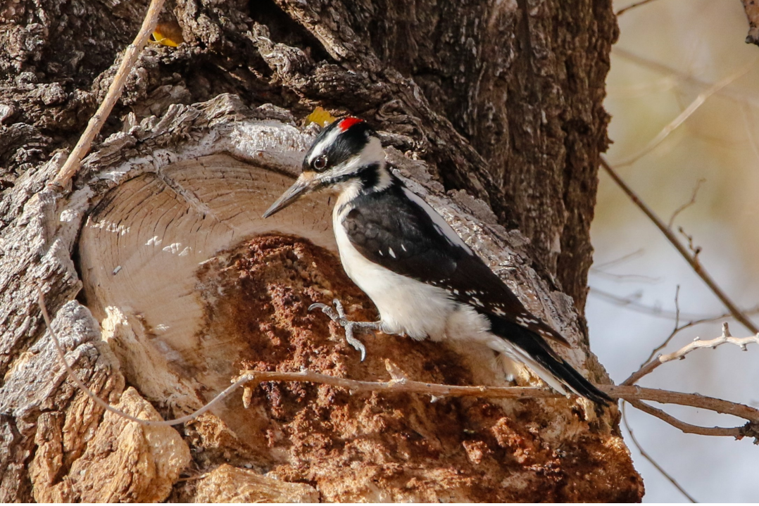
Hairy Woodpecker spotted during December CBC in La Laz

Mesilla Valley Audubon Society, a chapter of the National Audubon Society, is a conservation and natural history organization in southern New Mexico that promotes appreciation and conservation of birds, other wildlife and habitat, through environmental education, issue advocacy, and natural history experiences.