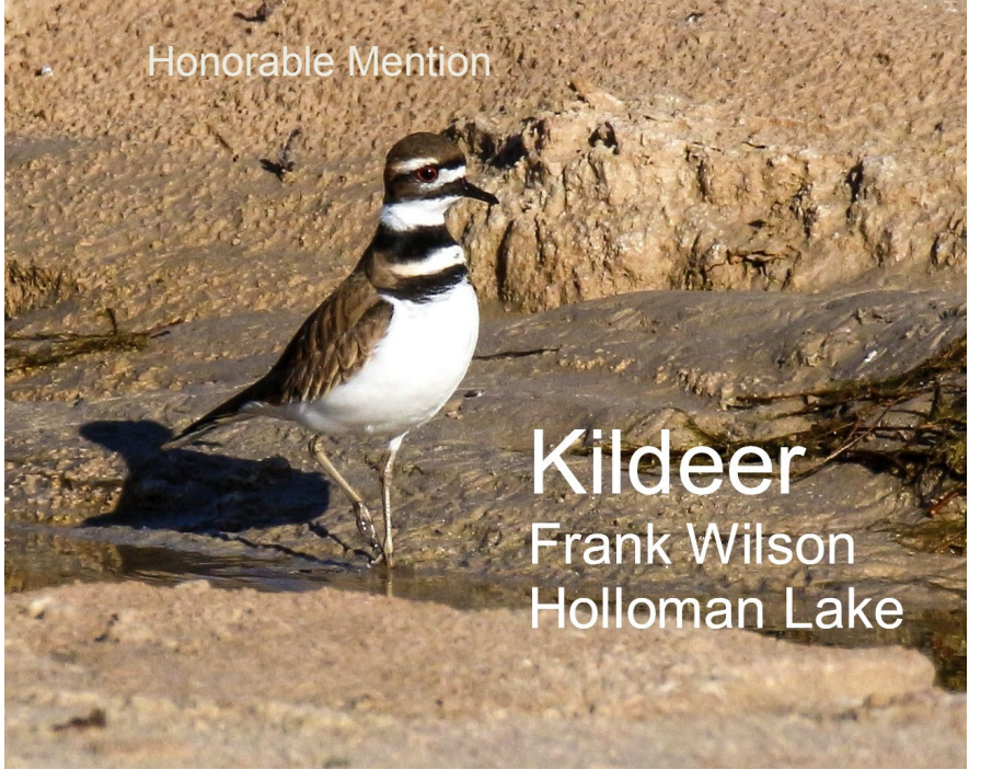
Photo Contest Rules: Photos submitted must have been taken in our local area, i.e., Sierra, Otero, or Dona Ana Counties only, and during the past 12 months. Our publications committee judges entries based on photo quality, subject interest, and subject variety. Please include the location taken and name of species in your email. Our newsletter editor makes the final selection for publication. From these, one is chosen as the First Prize winner.

By submitting your photo you automatically grant Mesilla Valley Audubon Society (MVAS) publication rights for one year. MVAS may use your photo in any of our publications, including newsletters and our annual calendar. Photos should be submitted electronically as a high resolution jpg file to this email address judi626@earthlink.net.