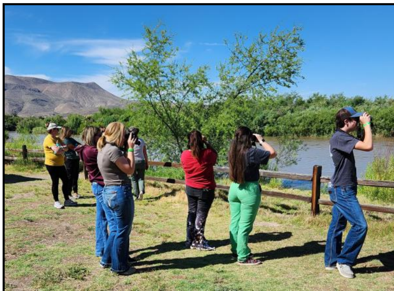
Photo of 4-H students birding at Leasburg Dam State Park