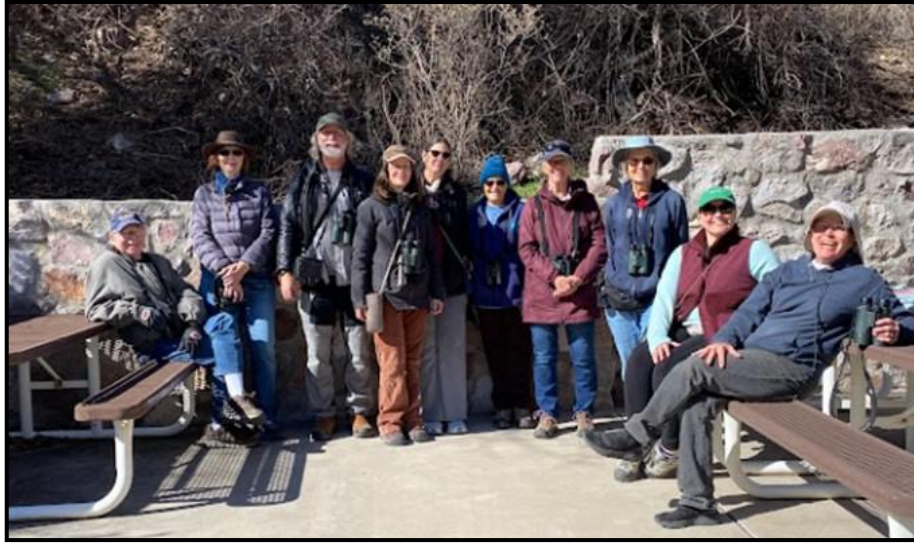
Mindful Birding on bird walks led by Holly Thomas